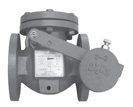
Figure 2: CV 31WF-CI ANSI Class 125 • Cast Iron