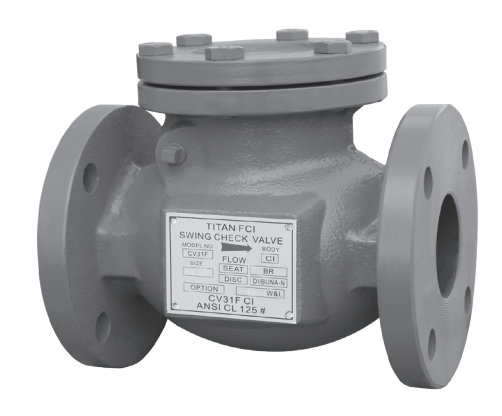
Figure 1: CV 31-FCI ANSI Class 125 • Cast Iron