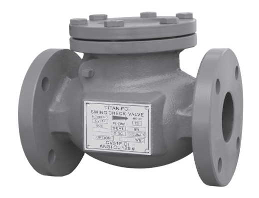
Figure 3: CV 31-FCI ANSI Class 125 • Cast Iron